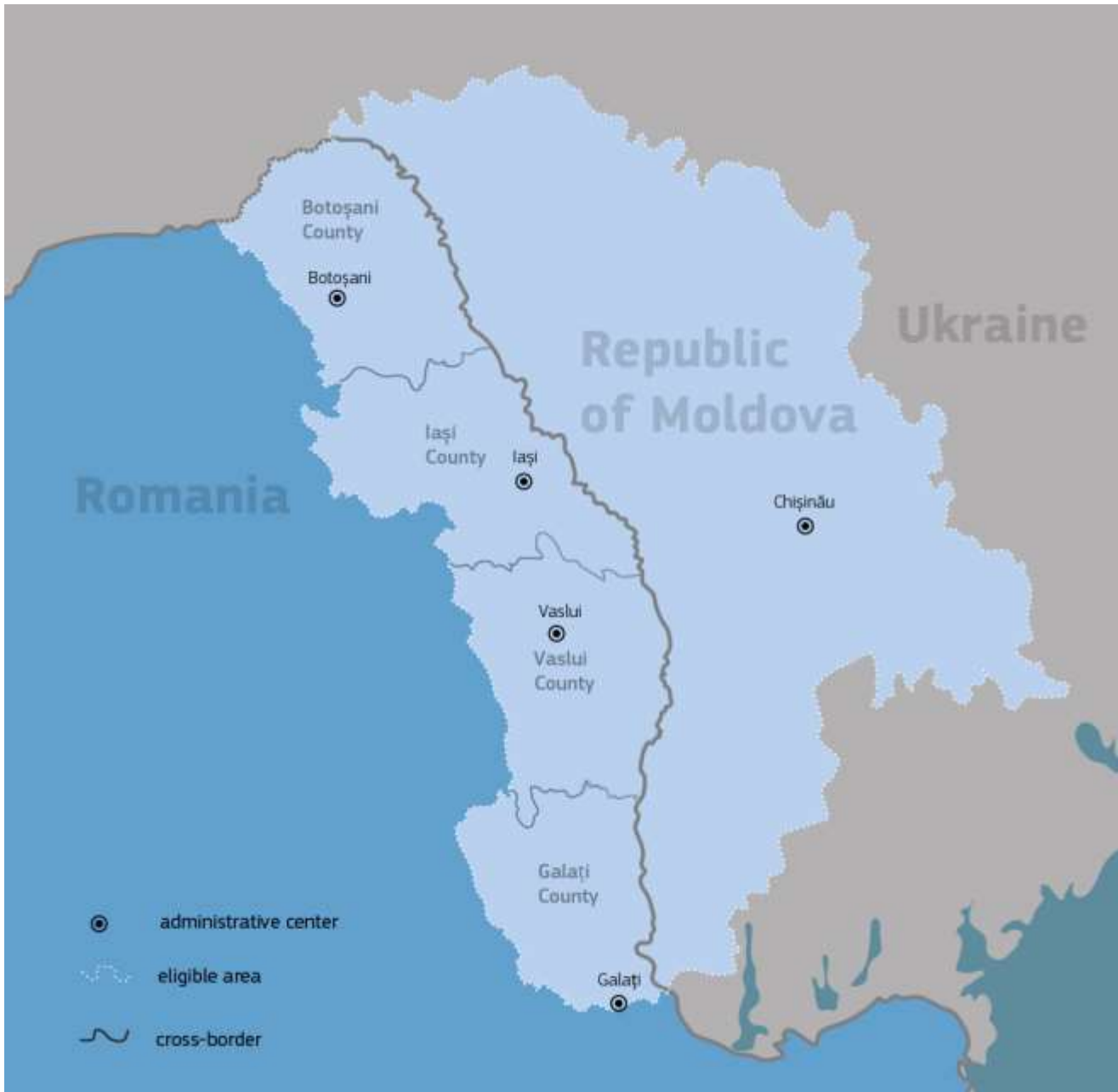
Map of the programme area